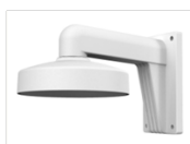
DS-1272ZJ-120 Wall mount